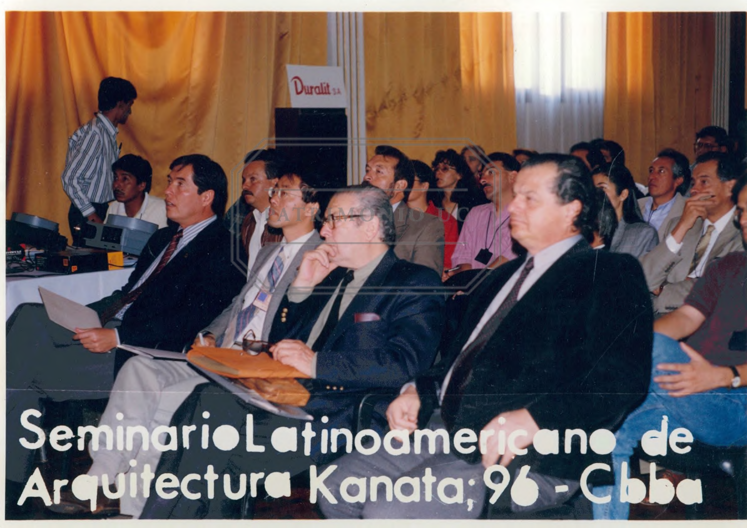
Seminario Latinoamericano de Arquitectura Kanata; 96 - Cbba