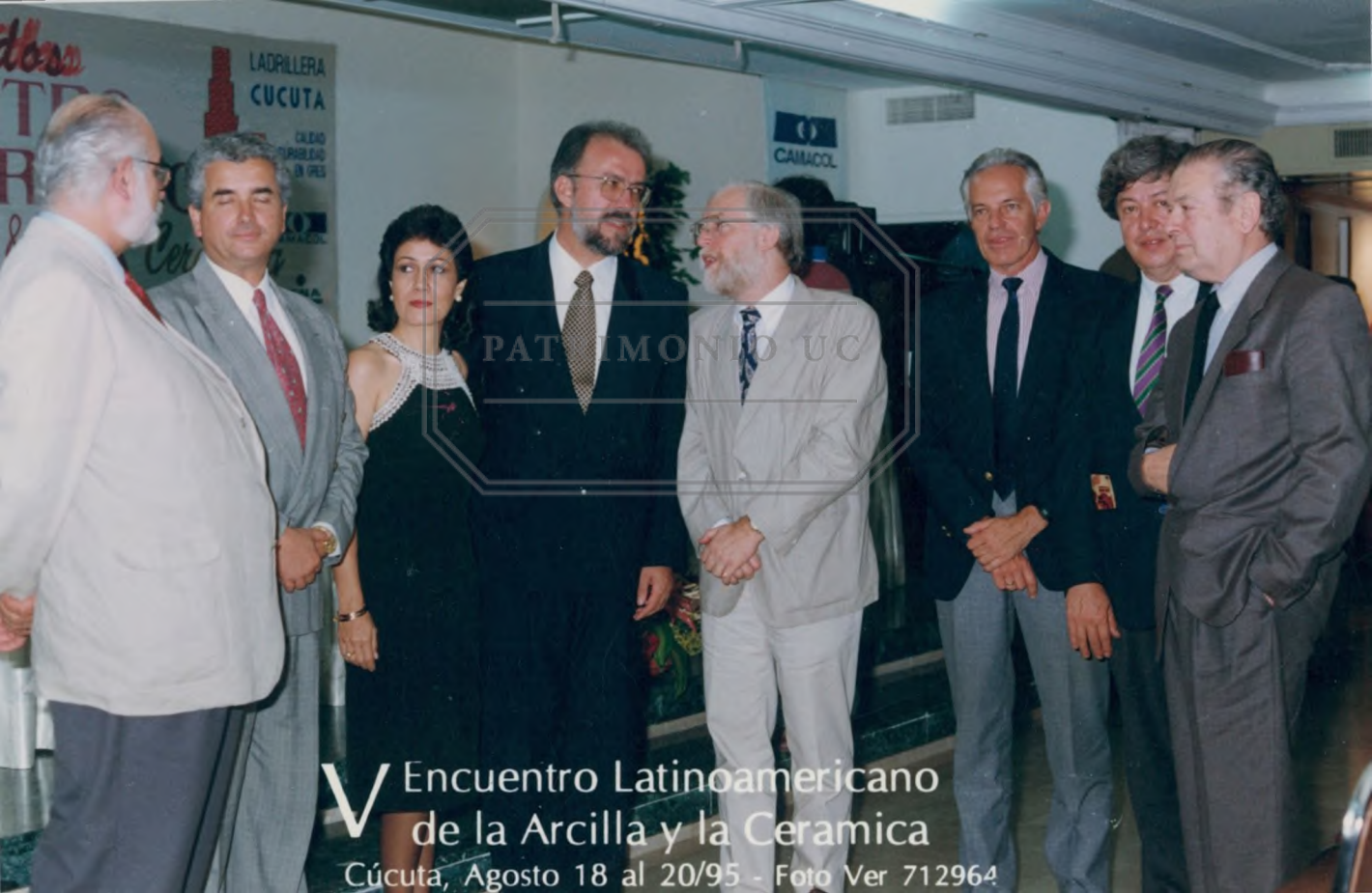
V Encuentro Latinoamericano de la Arcilla y la Cerámica Cúcuta, Agosto 18 al 20/95 - Foto Ver 712964